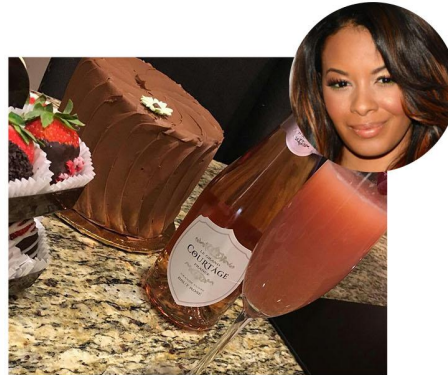
vanessajsimmmons followers: 1,200,000 likes: 4,218