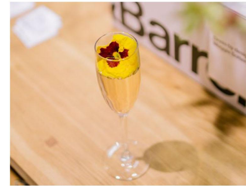
Instagram Followers 539,000