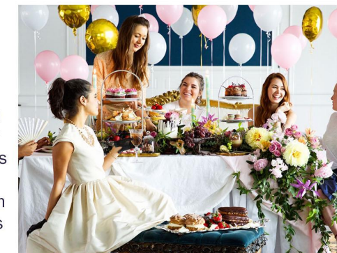
4 Million Monthly Pageviews