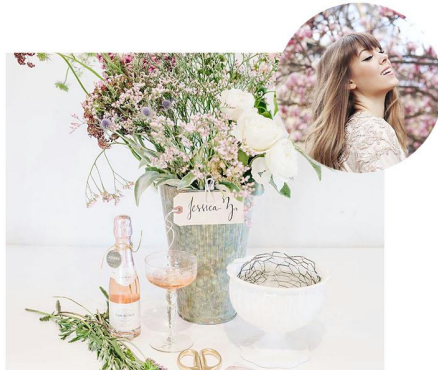
margo and me followers: 228,000 likes: 4,441