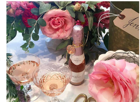
18 Million Monthly Pageviews